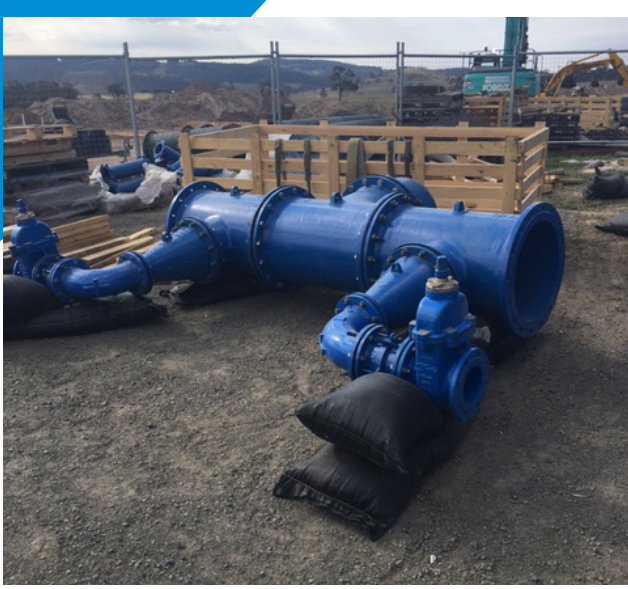
Off take assembly.