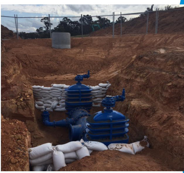
Gate valve assembly installation.