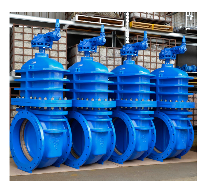
DN 750 gate valves - ready for delivery.