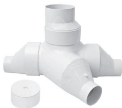
Maintenance Shaft 45° Junction