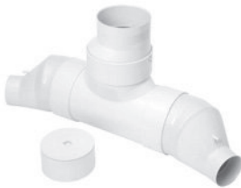
Maintenance Shaft Elbow