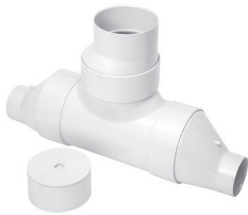
Inline Maintenance Shaft