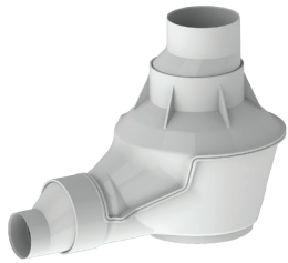
Central Axis Maintenance Shaft

The PVC Central Axis Maintenance Shaft offers a new solution to traditional manholes in waste water applications.